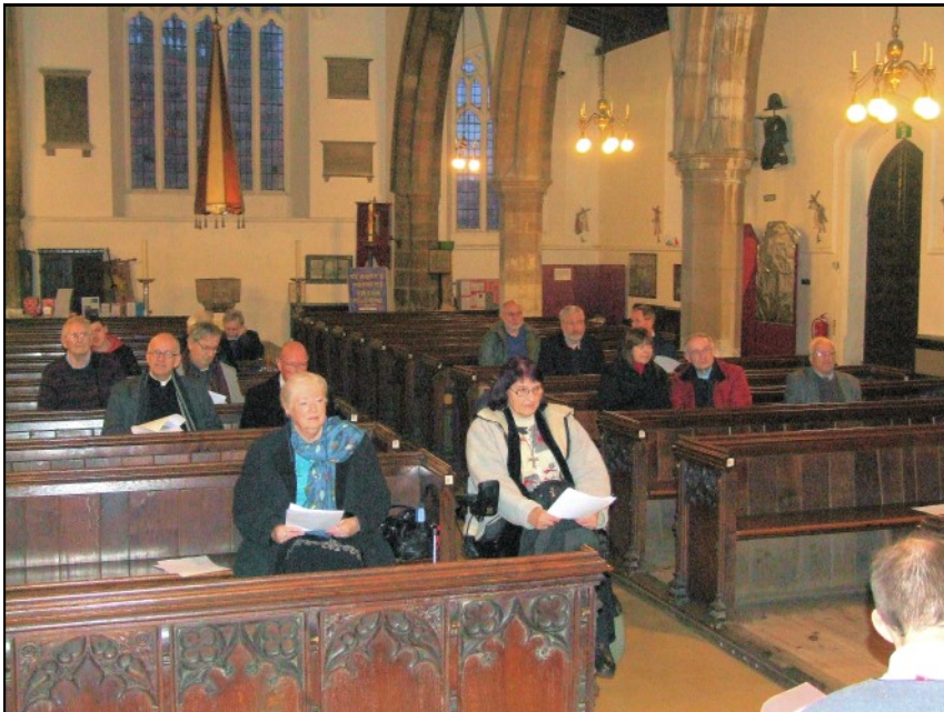
NDOA Members listen attentively to the Hon. Treasurer's report.

that expenditure had decreased considerably since the introduction of the electronic Newsletter (but not forgetting the paper option was still available).