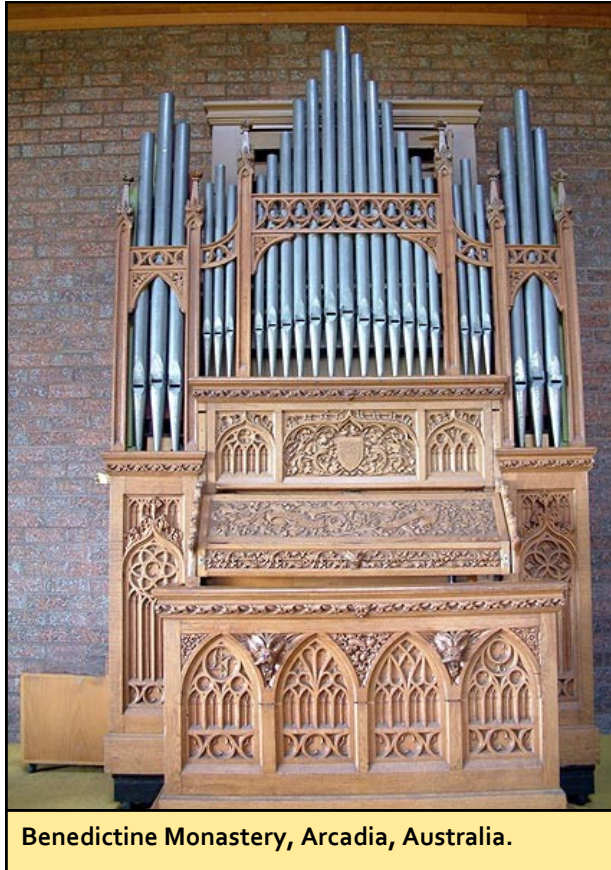
Benedictine Monastery, Arcadia, Australia.