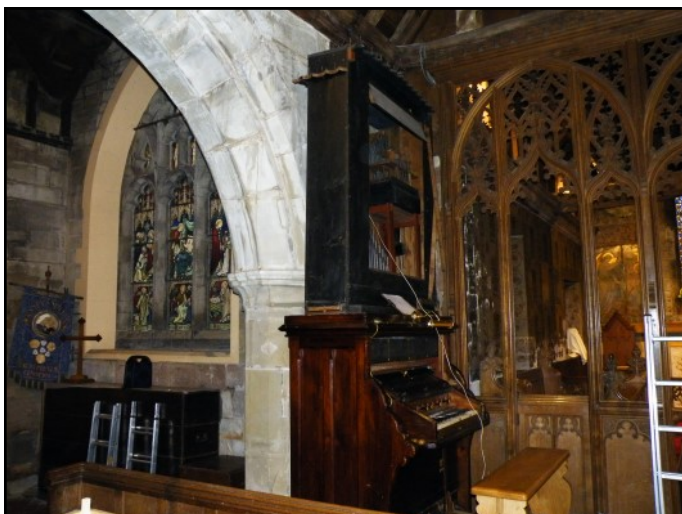
1. Ansty Church: This has to be the thinnest organ I have ever seen.

And so we come to the little organ at Ansty. The first thing to notice on the cover picture is that the organ is not much wider than the console. And, it transpires, not very deep either as we can see from this first picture: