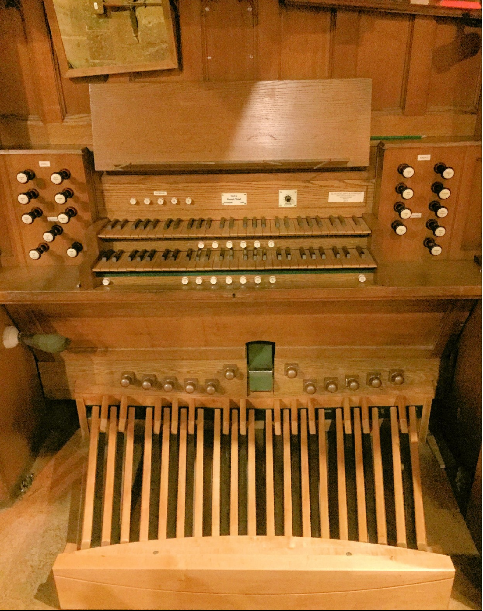
The console of St. John the Baptist, Kingsthorpe following fitting of electric draw-stop and piston mechanisms.