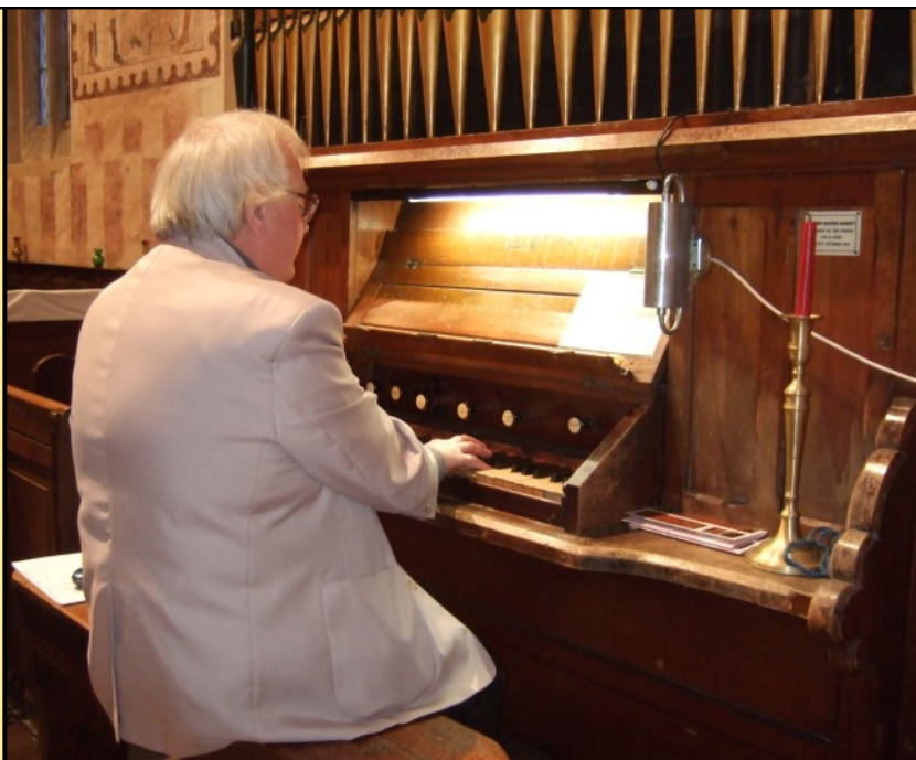
The writer demonstrating the St. Lawrence organ to the Friends of St. Lawrence (FOSL) at their June meeting.

into a slot, however, anything between pp and ff requires one foot permanently on the swell pedal. It is almost impossible to make a crescendo or decrescendo whilst also playing the tiny 1½ octave pedal board. The pedals are only an inch wide and I have found that the only way to avoid holding down two at once is to wear just a pair of thick socks. It seems unlikely that the pedals were much used in the past.